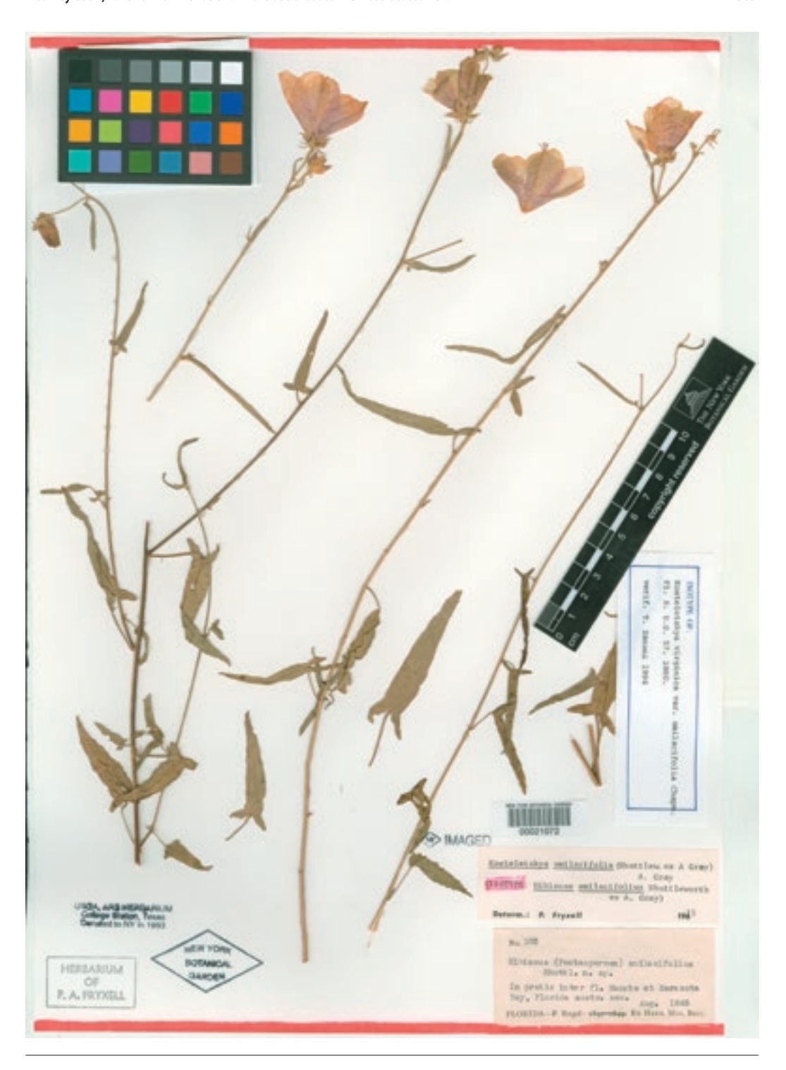
Fig. 7. Lectotype for Kosteletzkya pentacarpos var. smilacifolia (Chapm.) S.N. Alexander.