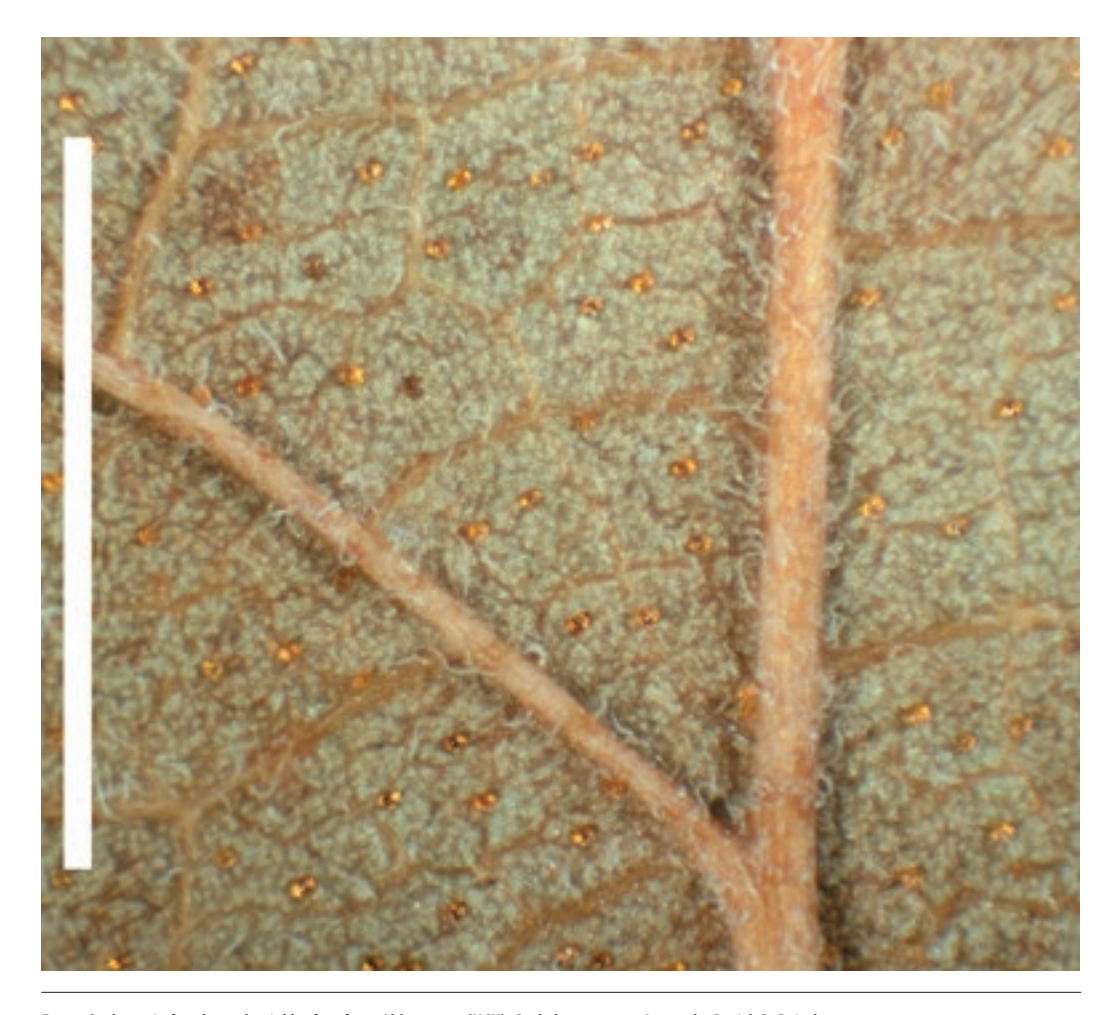
Fig. 5. Gaylussacia frondosa, abaxial leaf surface, Ahles 47938 (NCU). Scale bar = 3 mm.

found in the Caribbean is contradicted by several morphological differences – notably smaller and more numerous leaflets of the primary cauline leaves (15–25 vs. 9–17 leaflets), significant seasonal variation in leaf morphology (a feature not noted in the Caribbean taxa), and clear differences in flowering period.