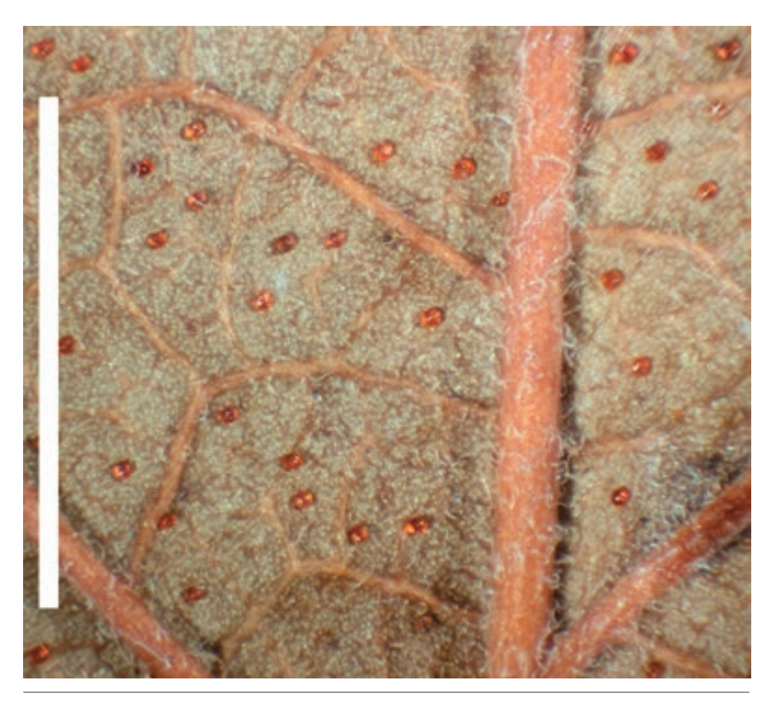
Fig. 6. Gaylussacia nana, abaxial leaf surface, Bozeman 10107 (NCU). Scale bar = 3 mm.

recognize taxon "floridana" at species rank, and for now in Dalea (pending continuing molecular analysis), a new combination is proposed.