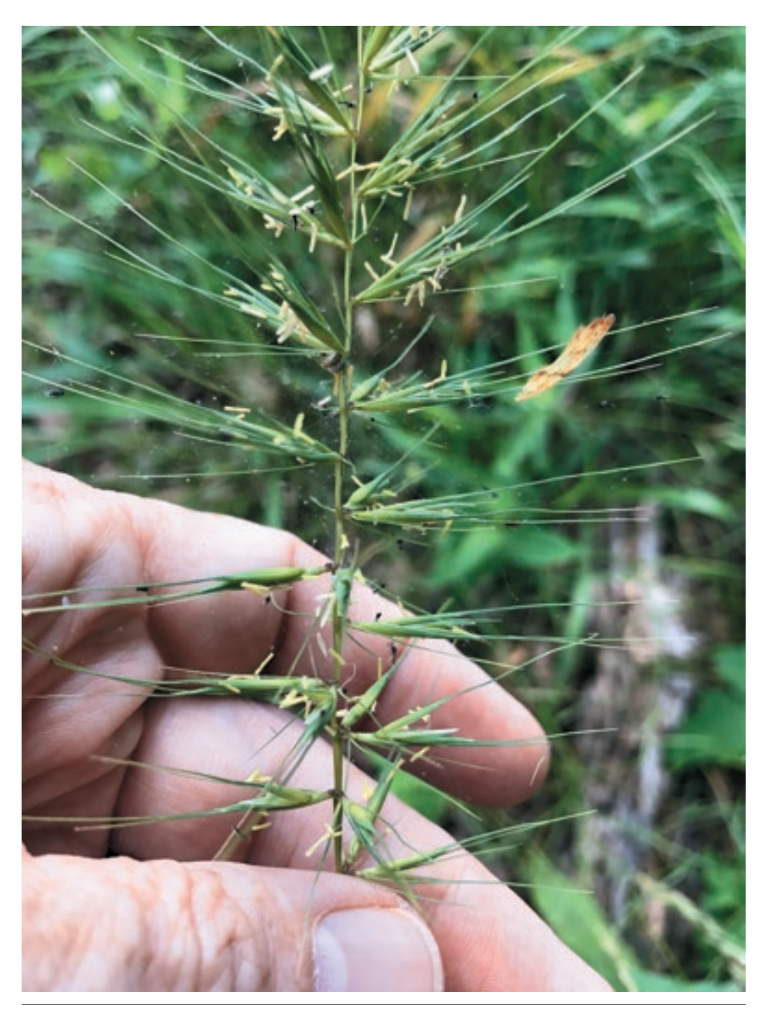
Fig. 8. Elymus hystrix var. piedmontanus, Caswell County, NC, 29 May 2017.